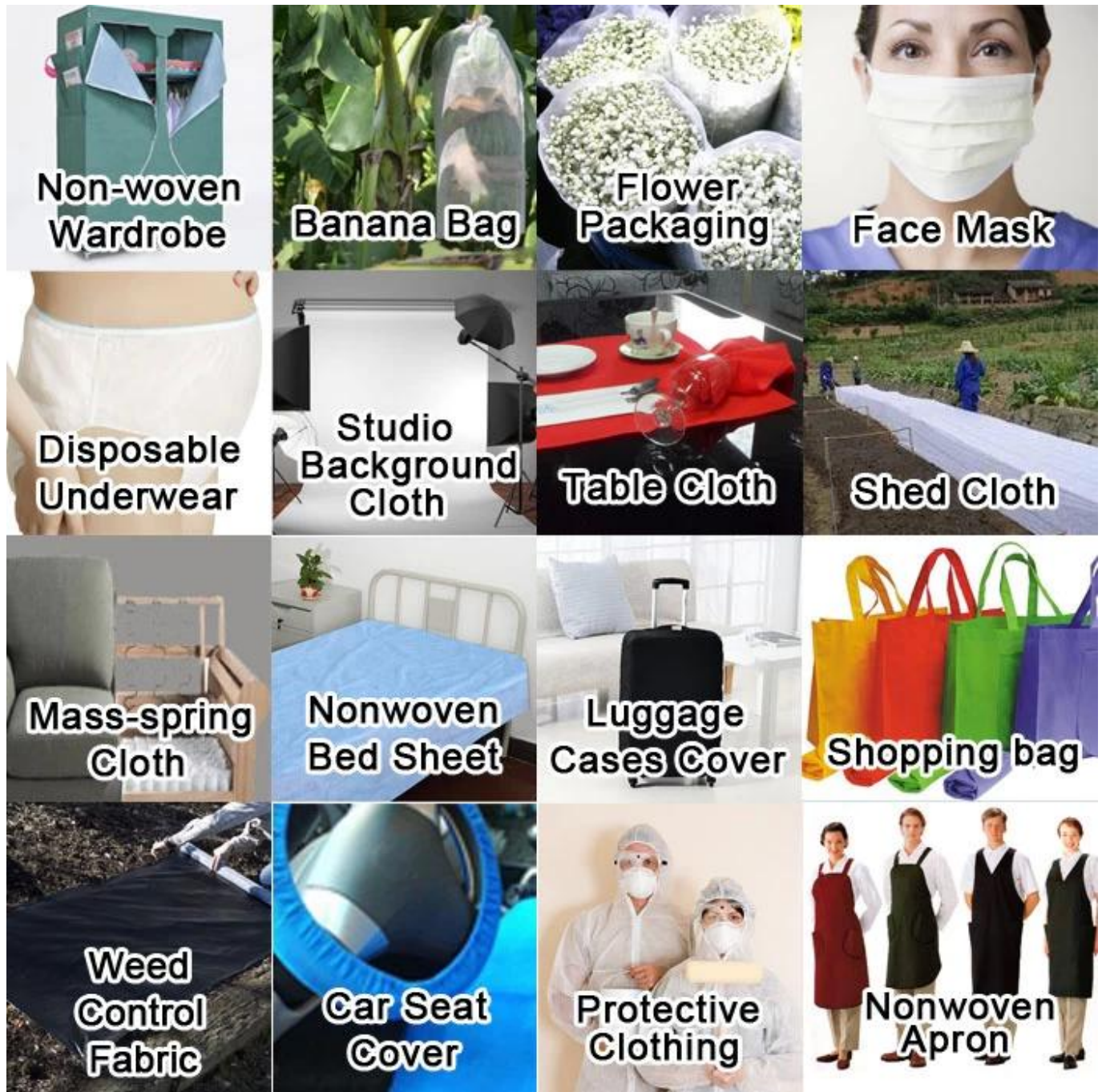
Product Packaging and Shipping of Non Woven Fabric