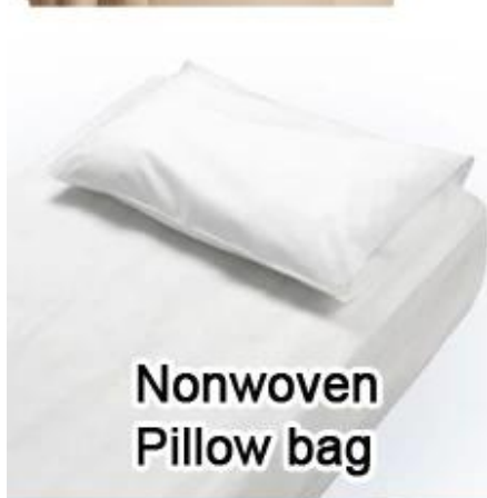
Nonwoven Pillow bag