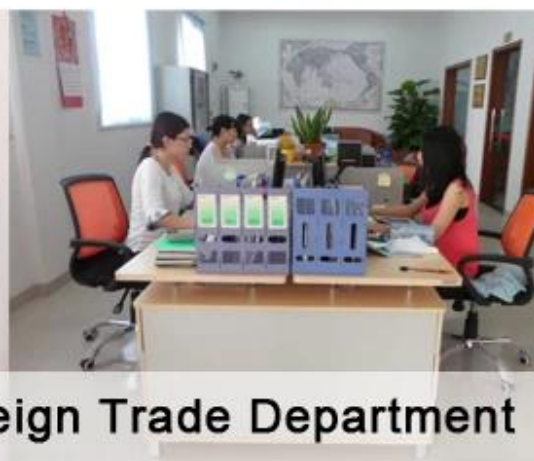
Foreign Trade Department