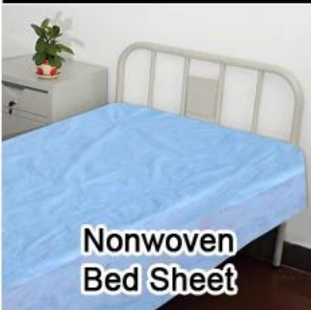
Nonwoven Bed Sheet