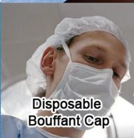
Disposable Bouffant Cap