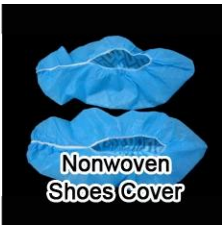
Nonwoven Shoes Cover