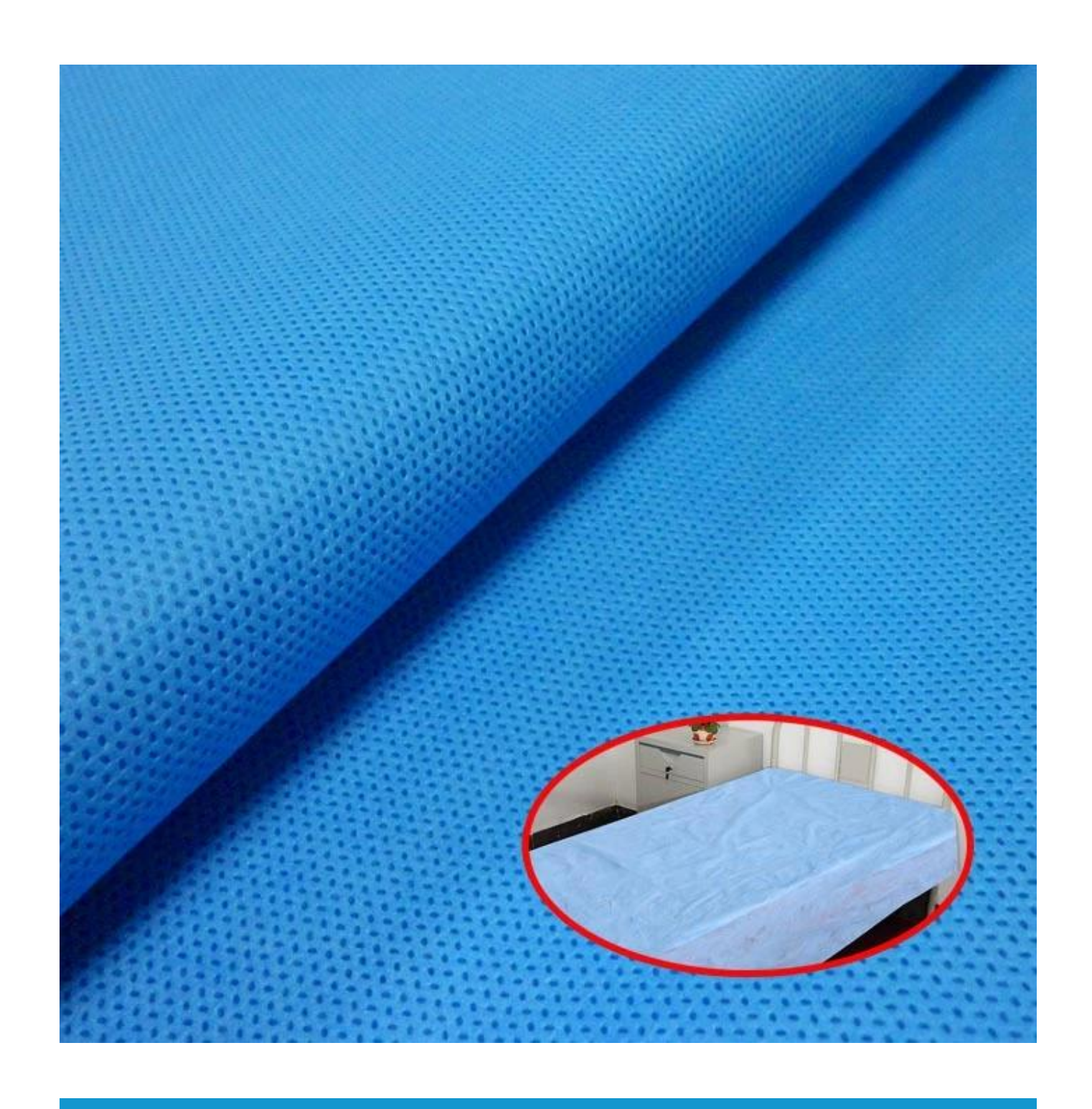
Related Applications of Non Woven Fabrics