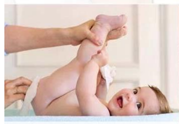
spunlace nonwoven fabric for wet tissue