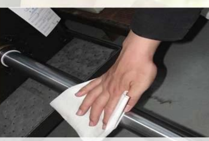
spunlace nonwoven fabric for industrial wiping