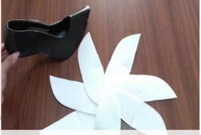
spunlace nonwoven fabric for shoe material

Product Packaging & Shipping of Microfiber Spunlace Disposable Nonwoven Fabric For Microfiber Drying Towel