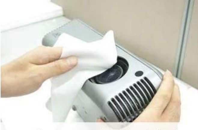
spunlace nonwoven fabric for electronics