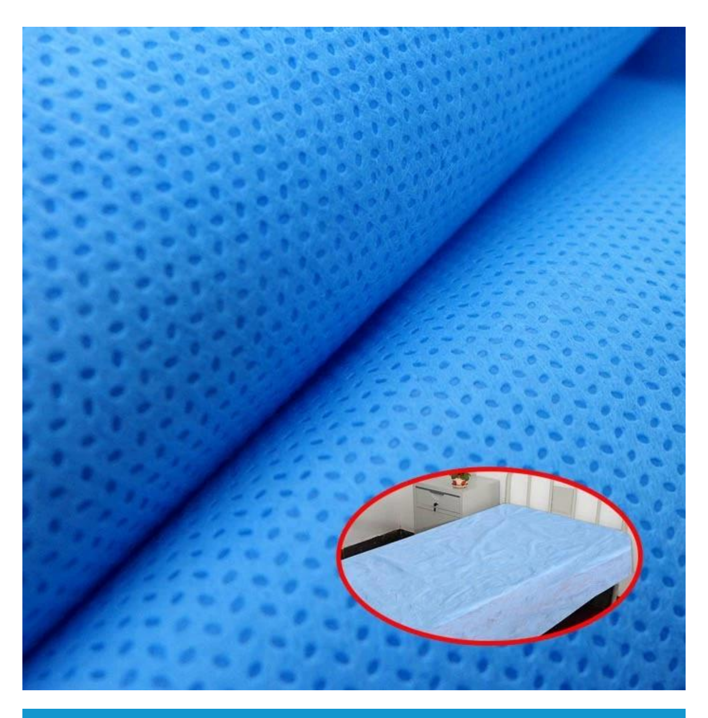
Applications of Family Home Bed Sheet Flat Sheet Fitted Massage Bed Sheet