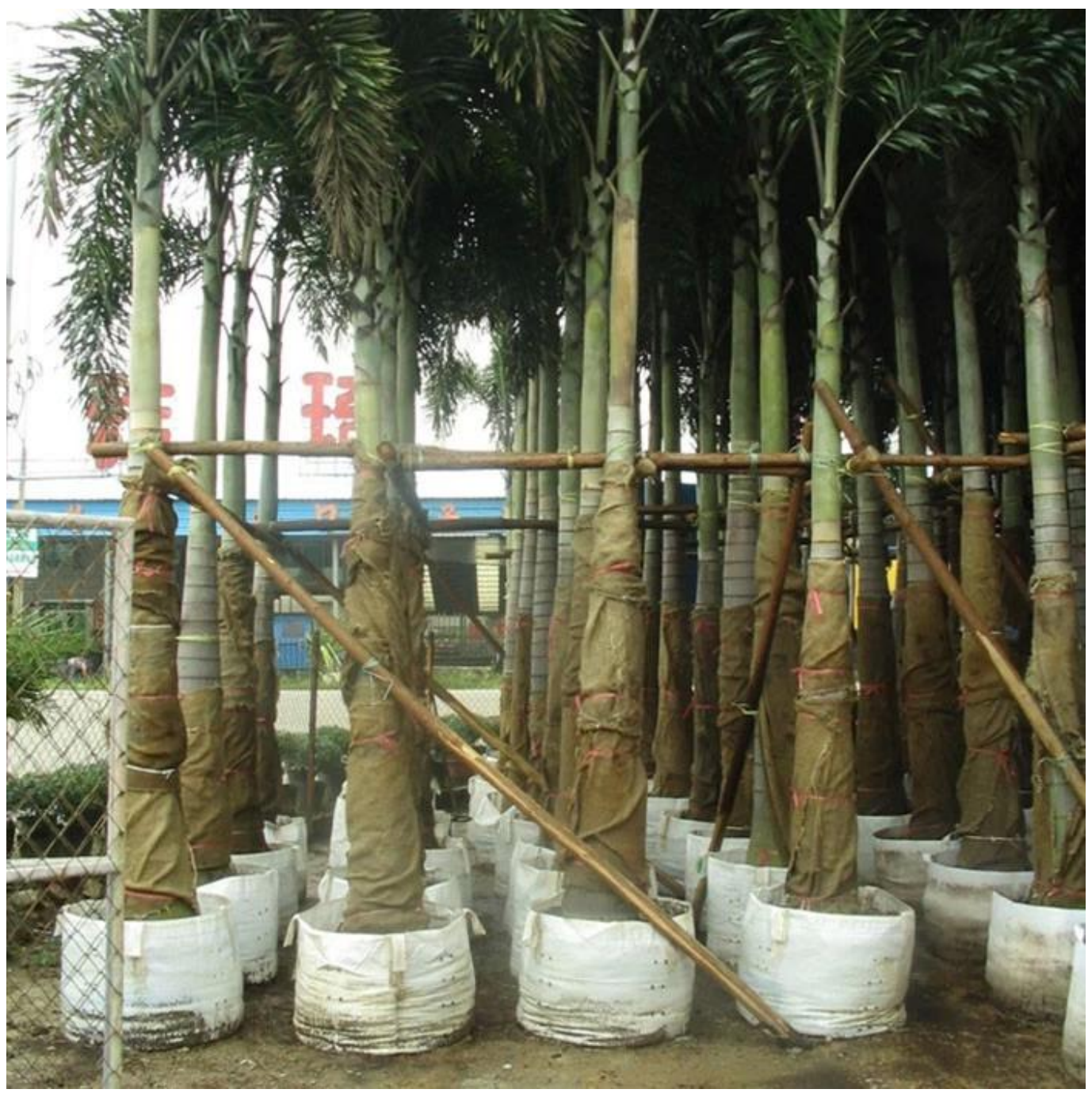
China nonwoven gardening planter pots custom

Product Packaging & Shipping of Breathable Potato Tomato Planter Pots For Outdoor Vegetables Plant Flowers Nonwoven Grow Bag