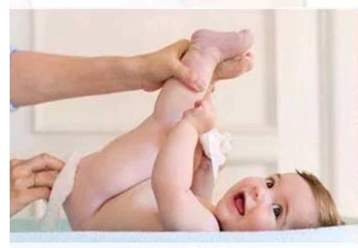
spunlace nonwoven fabric for wet tissue