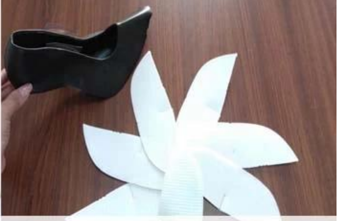
spunlace nonwoven fabric for shoe material

Product Packaging & Shipping of Biodegradable Bamboo Cotton Spunlace Nonwoven Non Woven Fabric Roll For Baby Wet Wipes