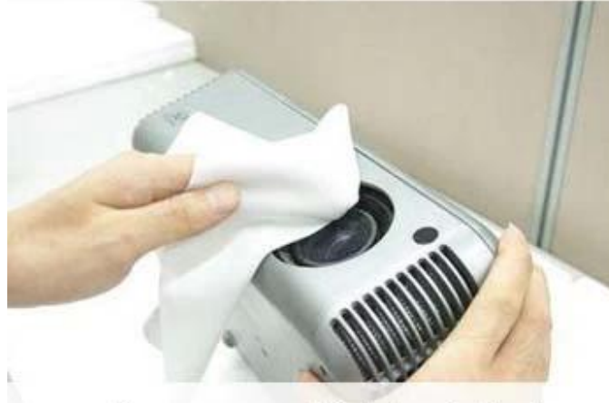
spunlace nonwoven fabric for electronics