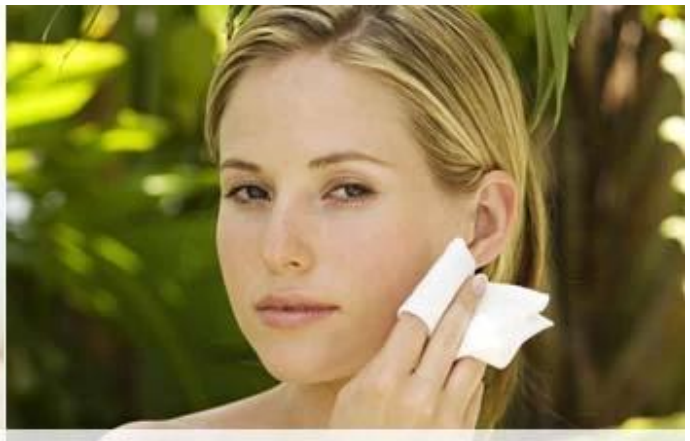
spunlace nonwoven fabric for make-up