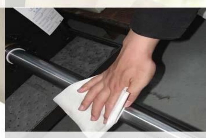
spunlace nonwoven fabric for industrial wiping