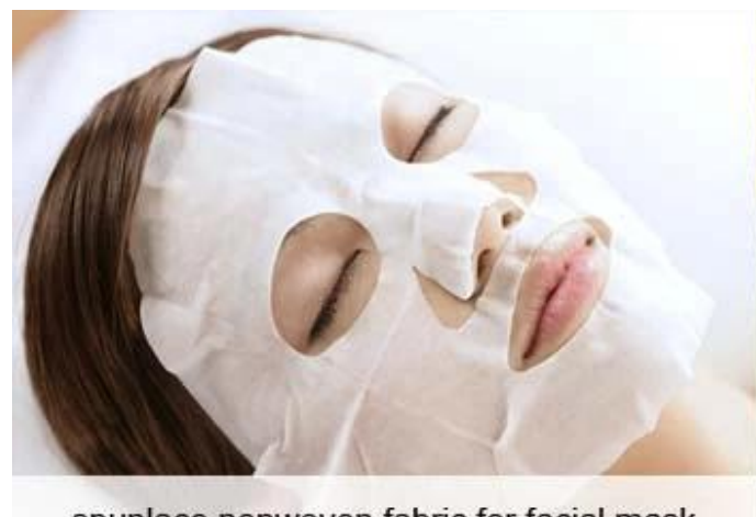
spunlace nonwoven fabric for facial mask