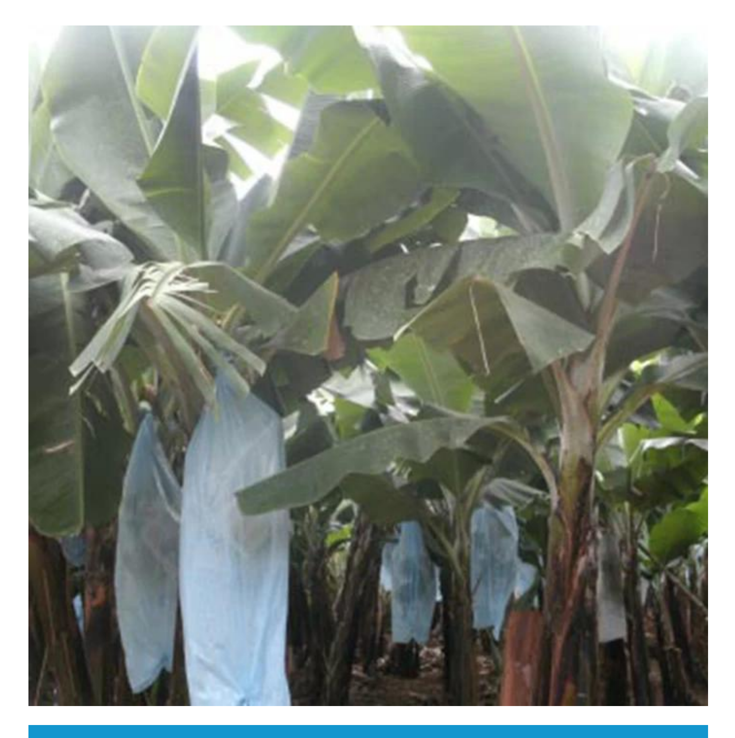
Product Packaging and Shipping of Non-pollution Banana Protection Cove