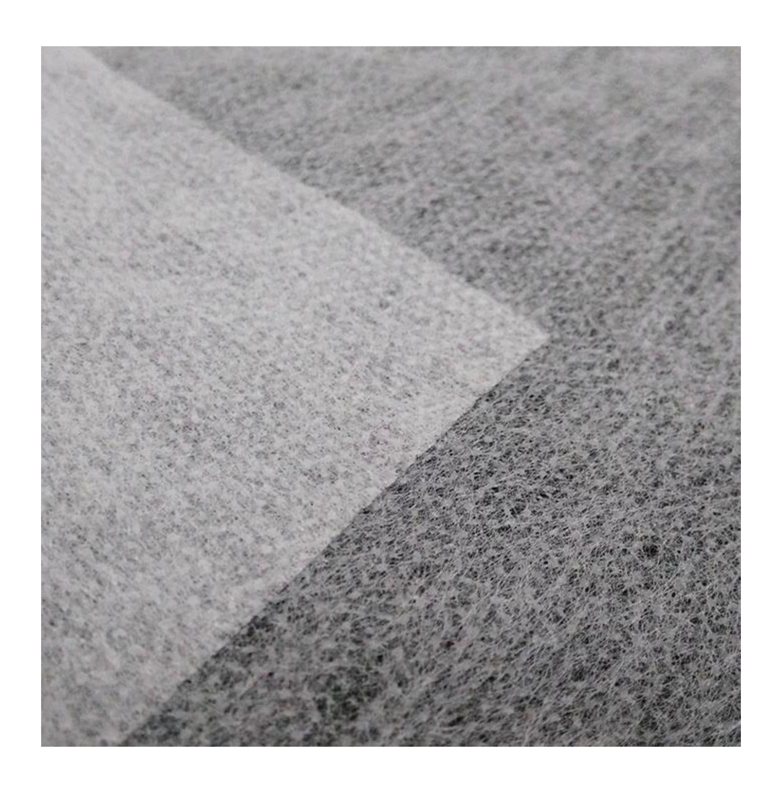
Product Packaging & Shipping of Antibacterial Polylactic Acid Nonwovens For Sanitary Materials Biodegradable Non Woven Fabric

China polylactic acid nonwoven fabric manufacturer