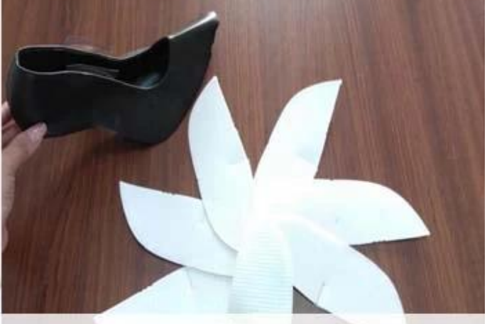
spunlace nonwoven fabric for shoe material

Product Packaging & Shipping of Nonwoven Spunlace Pure Cotton Fabric For Cotton Tissue