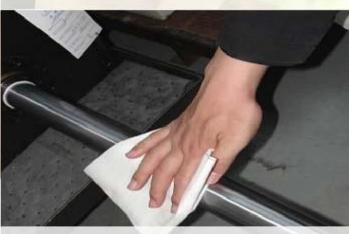
spunlace nonwoven fabric for industrial wiping