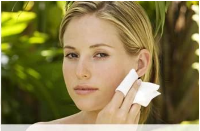
spunlace nonwoven fabric for make-up