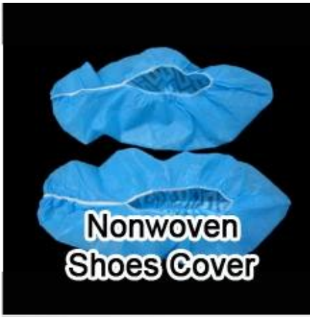
Nonwoven Shoes Cover