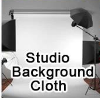
Studio Background Cloth