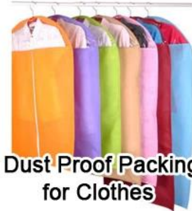
Dust Proof Packing for Clothes